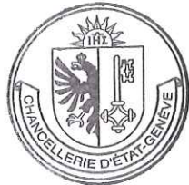
ANJA WYDEN GUELPA Chancelière d'Etat

FOR THE GOVERNMENT OF THE REPUBLIC AND CANTON OF GENEVA