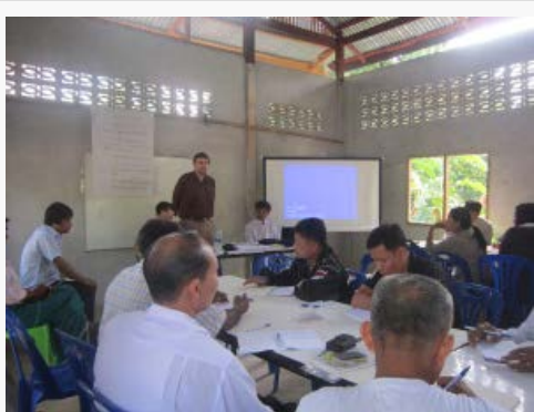
Child Protection workshop