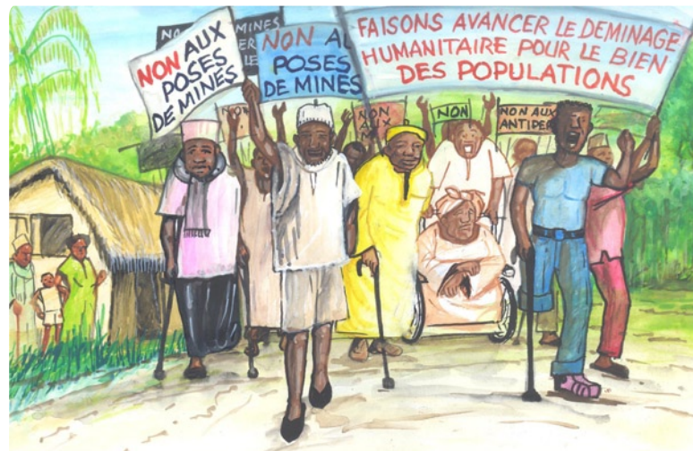
From the reference manual on landmines used in community meetings in Casamance to address questions of AP mines and humanitarian mine action.

In December 2009, more than 140 community leaders living in the mine-affected Casamance region participated in two advocacy meetings organized by Geneva Call and its local partners. The meetings brought together village chiefs, local elected officials, school teachers, religious leaders, elders, leaders of local youth and women's groups as well as representatives of local civil society associations from the rural communities of Boutoupa Camaracounda and Nyassia. The aim of the meetings was to inform community leaders on the AP Mine Ban Convention's norms and to encourage them to contribute to ongoing mine action efforts, notably by helping to convince members of the Movement of the Democratic Forces of Casamance (MFDC) to abandon AP mine use and accept humanitarian demining operations. The communities were chosen because of their proximity to MFDC camps and their contamination by mines. Facilitators included the Senegalese National Mine Action Centre (CNAMS), Geneva Call's local partner Association pour la Promotion Rurale de l'Arrondissement de Nyassia - Solidarité, Développement, Paix (APRANSDP) and three other local NGOs active in mine action