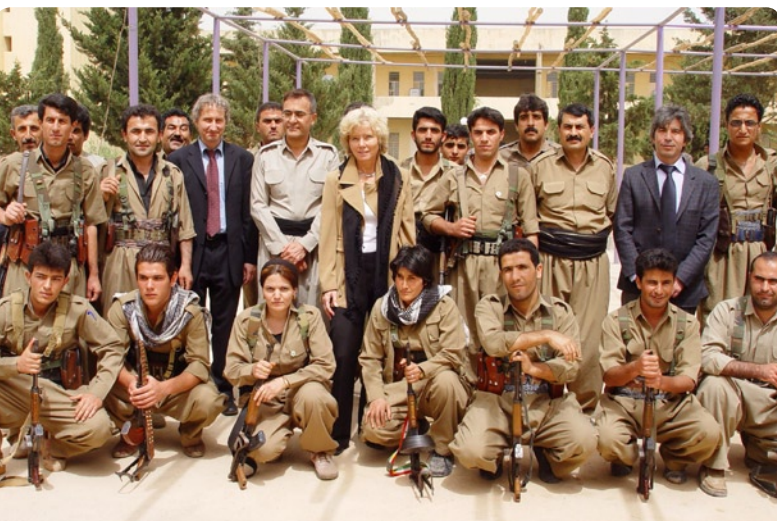
Signing ceremony, Iraqi Kurdistan 2010.

These signatures bring to 41 the armed non-State actors having adhered to the Deed of Commitment banning AP mines.