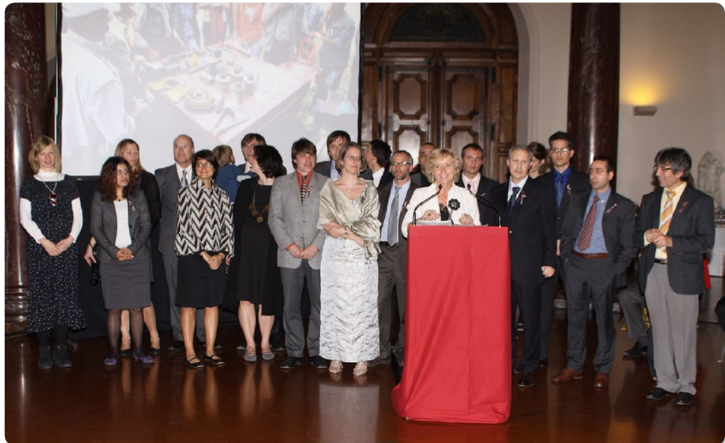
Members of the Geneva Call team. Missing are the many partners from the field who make Geneva Call's work possible, and could not attend.

http://www.genevacall.org/10-years/10-years.htm