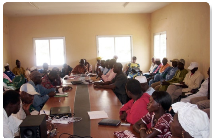
AP mine ban advocacy meeting with community leaders, Nyassia, Casamance region, December 2009.

and peace-building. During the sessions, participants were handed out a small 16-page reference manual published by Geneva Call and APRAM. This manual explains the AP Mine Ban Convention's norms, the landmine situation in Senegal and what role ordinary people can play to support mine action. After the sessions, they returned home to explain and distribute manuals to fellow villagers and, in some cases, to MFDC fighters. Geneva Call is currently extending the meeting format to other rural communities in Casamance.